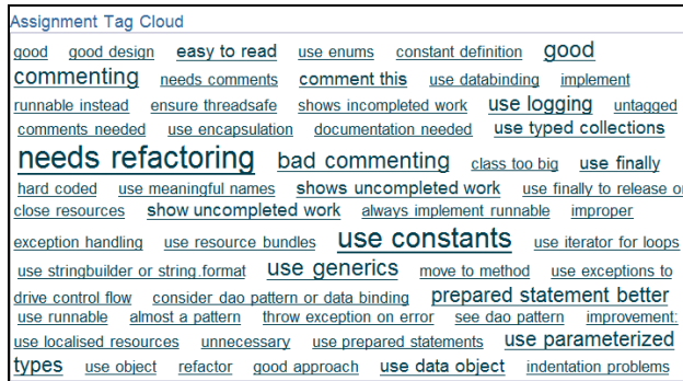
Figure 2 – Assignment Tag Cloud

to the quantity of results generated. However, it is interesting to that a majority of groups who did not share their work occur in the mid range of marks. That is four groups between the 65% - 80% range.