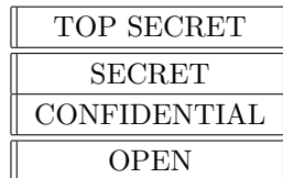
Fig. 9.1 – multilevel security

To start with a simpler case, suppose you're trying to set security policy at the tax collection office. Staff have been caught in the past making improper access to the records of celebrities, selling data to outsiders, and leaking income details in alimony cases [158]. How might you go about stopping that?