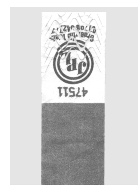
Figure 12.2 A wristband seal from our local swimming pool.

The simplest attack is to phone up the supplier; boxes of 100 wristbands cost about $8. If you don't want to spend money, you can use each band once, then ease it off gently by pulling it alternately from different directions, giving the result shown in the photo. The printing is crumpled, though intact; the damage isn't such as to be visible by a poolside attendant, and could have been caused by careless application. The point is that the damage done to the seal by fixing it twice, carefully, is not easily distinguishable from the effects of a naive user fixing it once. (An even more powerful attack is to not remove the backing tape from the seal at all, but use some other means—a safety pin, or your own glue—to fix it.)