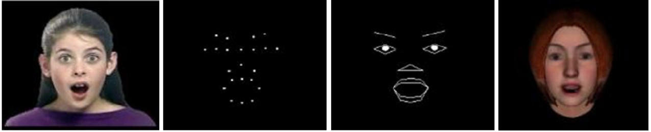
Figure 1: Example of the three representations generated from the original video using automatically tracked feature points

empirically computed as half of its width. Compared to point-based displays, the stick-figure representation presents the rough outline of facial features, and is therefore more face-like and familiar to people. The stick-figure models were also rendered on black background consistent with point-based displays.