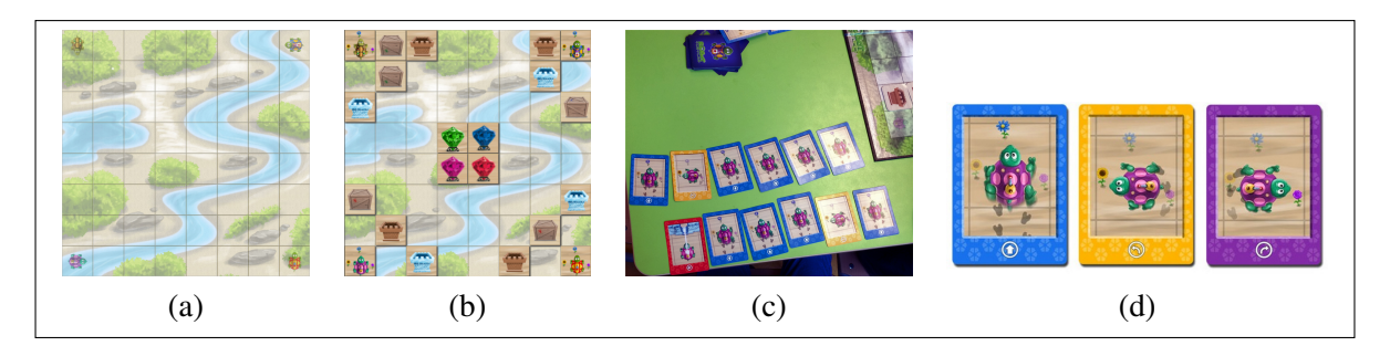
Figure 1 – The Robot Turtle game: (a) an empty board (b) a board with a maze (c) one solution to a Robot Turtle exercise in the classroom (d) the basic movement cards