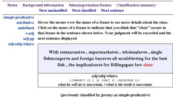
Figure 6: Sample classification screen for web annotation tool

ular sentences could not be classified (which is useful for further system development, as discussed in section 5). A screenshot is shown in figure 6. The resulting annotation revealed 19 of the 30 SCFs in the test data.