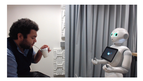
Fig. 1: Setup of the beverage tasting study.

SoftBank Robotics [27]. This robot is commercially available and has been widely used in Human-Robot Interaction (HRI) studies e.g. , [28]. In this study, the Pepper robot was programmed to communicate and engage with participants through gestures, dialogic speeches, and LED lights in a Wizard-of-Oz manner (partially operated by the experimenter).