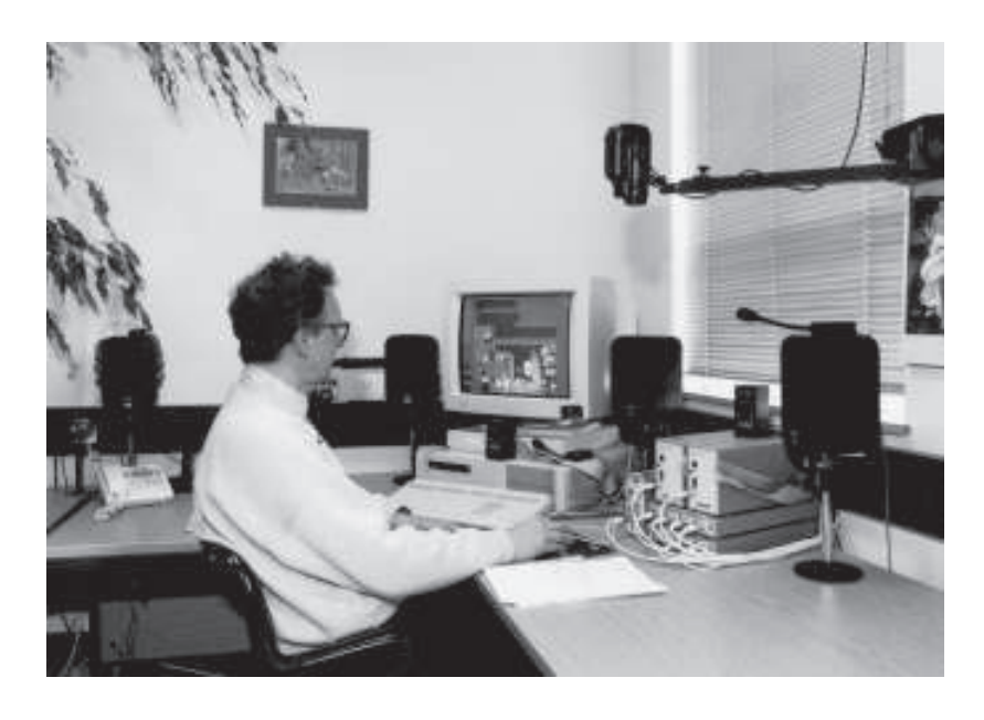
A Medusa workstation equipped with multiple cameras, speakers and microphones. Note the ATM network switches in the lower right, just under the video bricks.

looking through a remote camera does not have any extra performance cost with respect to looking through a local camera.