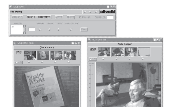
A two-way multistream conversation using MDphone

The user interface tries to present all those streams in an organic and meaningful arrangement, avoiding an excessive proliferation of controls. In view of the extension to a multiway conference system, all the views from the same user have been grouped in a single toplevel window with many subframes. All the views are shown in small frames and one of them — selectable by the user — is replicated in a larger frame. There are plans to make this selection automatic if desired by using an image processing module that would recognise which camera the user is facing; this is already being done for the audio, where the system dynamically switches to the microphone with the loudest signal. Moving the composite window on the desktop actually pans the sound in the quadraphonic image, so that in a multi-way conference the audio positioning of the participants is coherent with the positioning of their respective windows.