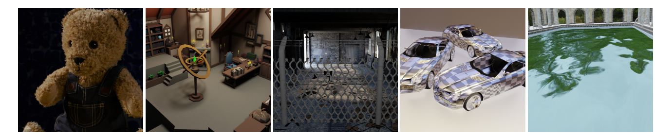
Fig. 1. A subset of scenes used for benchmarking (left to right): Large disparity: bear, sorcerers' room, Disparity: abandoned house, Non-Lambertian materials: cars, pool. The complete dataset consists of 11 synthetic and 4 camera-captured scenes.