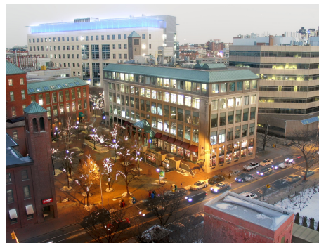
Low cost saliency pyramid compositing [Dodgson, et al., 2006] ** saliencypyramidcomposite(citynight,cityday,0.4,10,1,4,0,0,0,4)