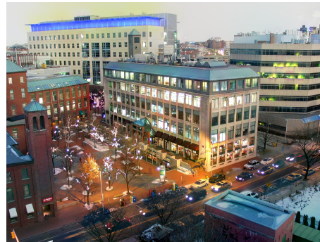
Coefficient selection using Laplacian pyramids [Burt, 1984] * tinearpyramidcomposite(citynight,cityday,citymask,10,tnf)