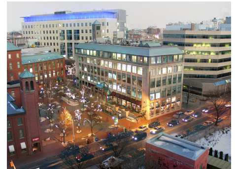
Weighted power mean using Laplacian pyramids [Grundland, et al., 2006b] * tinearpyramidcomposite(citynight,cityday,citymask,10,4)