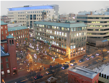
Linear interpolation using Laplacian pyramids [Burt and Adelson, 1983] * tinearpyramidcomposite(citynight,cityday,citymask,10,1)