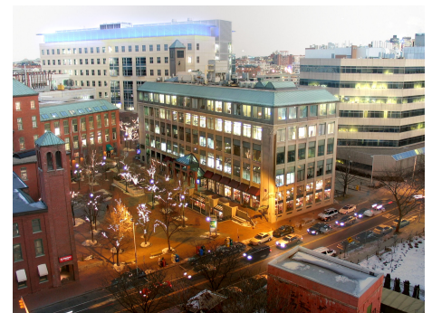
Contrast enhanced saliency pyramid compositing [Grundland, et al., 2006a, 2006b] ** saliencypyramidcomposite(citynight,cityday,0.4,10,4,4,0,0,0,1,64)