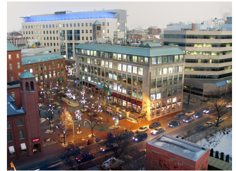
Contrast preserving pyramid compositing [Grundland, et al., 2006a] * contrastpyramidcomposite(citynight,cityday,citymask,10,1)