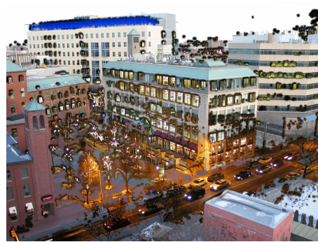
Linear interpolation of pixel colors [Porter and Duff, 1984] * tinearcomposite(citynight,cityday,citymask)