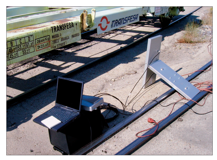
Figure 3. The test setup, showing RFID equipment for range measurements, using 2.5 cm \times 2.5 cm tags on moving targets.

Railway vehicle maintenance is time consuming. It requires checking many individual—often inaccessible—mechanical parts. But what if vehicle components could check themselves? Combining auto-ID technology and sensors means that parts could self-check and request service or replacement according to their age, mileage, or wear.