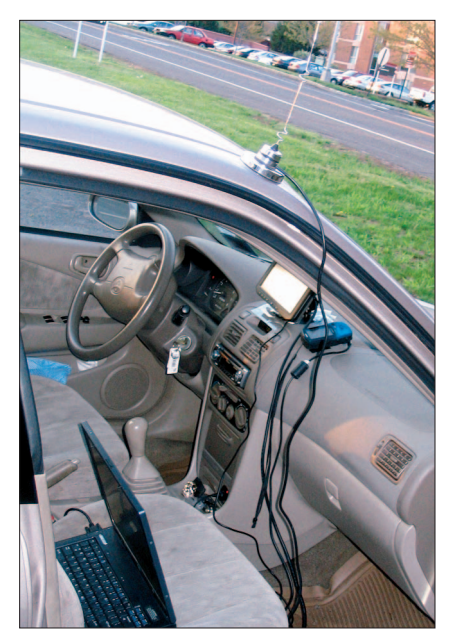
Figure 2. A car equipped with TrafficView.

A context-aware machine-vision component percepts the traffic situation and passes information to an expert recommender system. Traffic regulations, as specified by law, must be transformed according to a semantic model to be developed. The copilot system adds them to the expert recommender system's knowledge base. The behavior-recognition component constantly monitors the driver's behavior and responses to certain situations and updates the knowledge base with this information, thus enabling contextbased learning from experienced drivers in situations that traffic regulations don't clearly cover. A central expert recommender system infers decisions for the current driving situation on the basis of information from both the machine-vision component and the knowledge base. It either communicates deduced recommendations to the