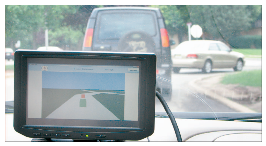
Figure 1. TrafficView's near-view panel displays cars as green or red rectangles, depending on their speed relative to the current car. In the picture, the car in front of the SUV brakes and becomes red in the panel.

tion to exchange data between disconnected herds of cars.