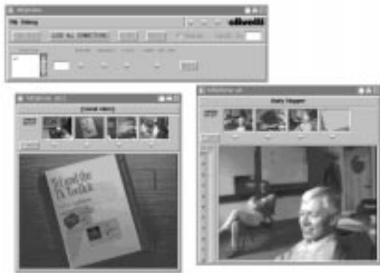
A two-way multistream conversation using MDphone

The user interface tries to present all those streams in an organic and meaningful arrangement, avoiding an excessive proliferation of controls. In view of the extension to a multi-way conference system, all the views from the same user have been grouped in a single toplevel window with many subframes. All the views are shown in small frames and one of them — selectable by the user — is replicated in a larger frame. There are plans to make this selection automatic if desired by using an image processing module that would recognise which camera the user is facing; this is already being done for the audio, where the system dynamically switches to the microphone with the loudest signal. Moving the composite window on the desktop actually pans the sound in the quadraphonic image, so that in a multi-way conference the audio positioning of the participants is coherent with the positioning of their respective windows.