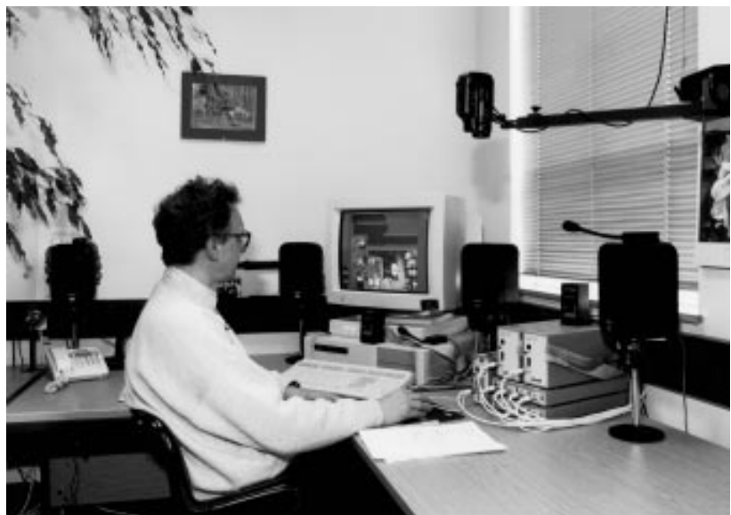
A Medusa workstation equipped with multiple cameras, speakers and microphones. Note the ATM network switches in the lower right, just under the video bricks.

looking through a remote camera does not have any extra performance cost with respect to looking through a local camera.