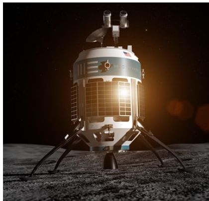
Artist's impression of the Moon Express MX-1E lander.

The company is currently building the lander, termed the MX-1E, and hopes to be finished by the end of the summer so it can ship it to the launch site in New Zealand.