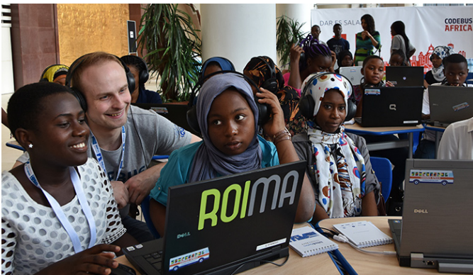
Teaching Sonic Pi at the Beats&Bytes tech conference in Dar es Salaam, Tanzania.