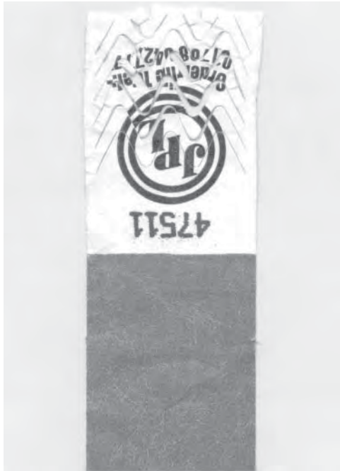
Figure 16.2: A wristband seal from our local swimming pool

The simplest attack is via the supplier's website, where boxes of 100 wristbands cost about $8. If you don't want to spend money, you can use each band once, then ease it off gently by pulling it alternately from different directions, giving the result shown in the photo. The printing is crumpled, though intact; the damage isn't such as to be visible by a poolside attendant, and could in fact have been caused by careless application. The point is that the damage done to the seal by fixing it twice, carefully, is not easily distinguishable from the effects of a naive user fixing it once. An even more powerful attack is to not remove the backing tape from the seal at all, but use a safety pin, or your own glue, to fix it.