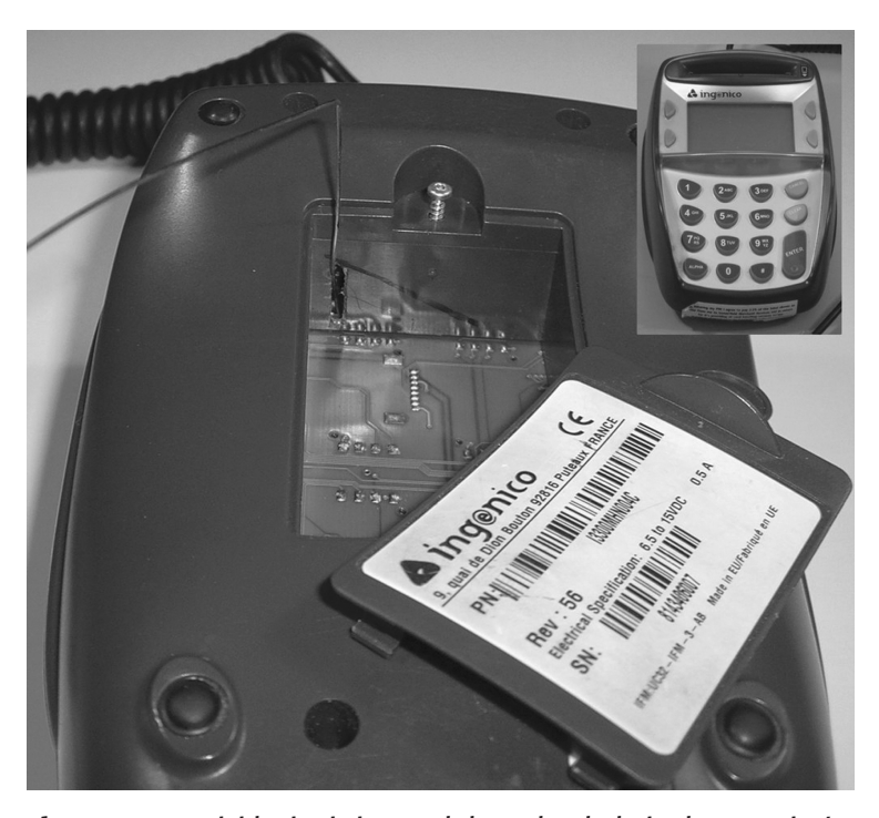
Figure 10.4: A rigid wire is inserted through a hole in the Ingenico's concealed compartment wall to intercept the smartcard data. The front of the device is shown on the top right.

Attacks exploiting the fact that the MAC can't be read by the merchant include 'yescards'. These are cards programmed to accept any PIN (hence the name) and to participate in the EMV protocol using an externally-supplied certificate, returning random values for the MAC. A villain with a yescard and access to genuine card certificates — perhaps through a wiretap on a merchant terminal — can copy a cert to a yescard, take it to a merchant with a reasonable floor limit, and do a transaction using any PIN. This attack has been reported in France and suspected in the UK [122]; it's pushing France towards a move from SDA to DDA. However, most such frauds in Britain still use magnetic strip fallback: many ATMs and merchants use the strip if the chip is not working.