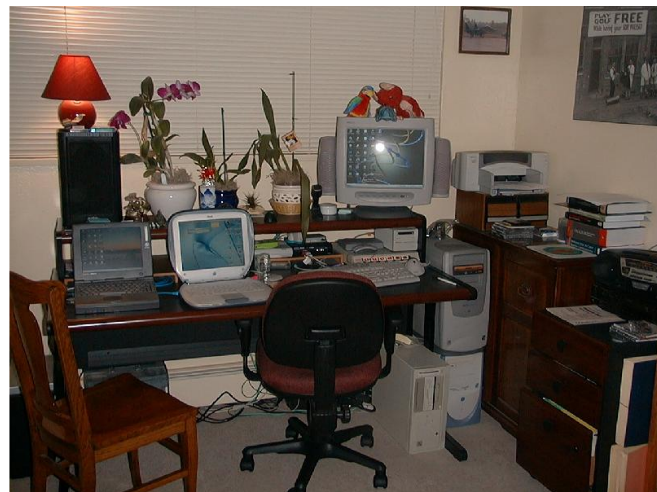
Current deployment of home network infrastructure

Three key challenges: providing legibility ; enabling agency ; supporting negotiability