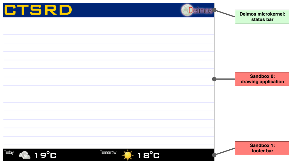
Figure 4.1: The Deimos touchscreen interface