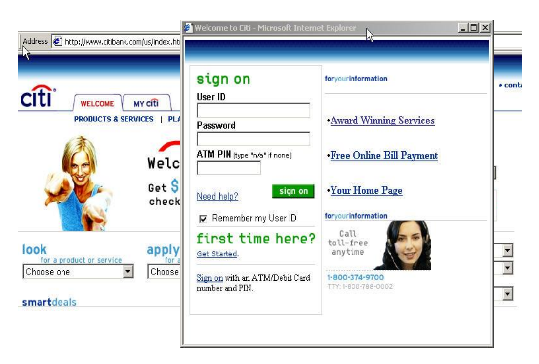
Figure 1: Spoofed pop-up with phony login visually on top of a real site.