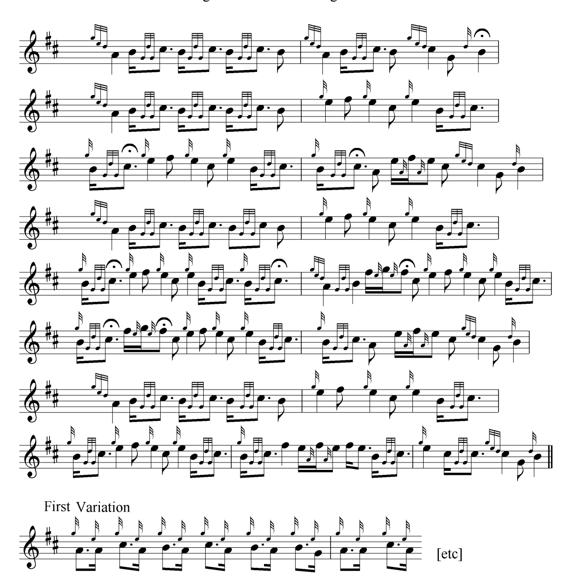
Here follows the doubling of 1st Variation, then Tourluidh & Creanluidh - & DC