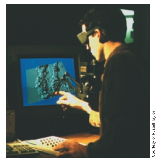
5 View of UNC nanoManipulator connected to an atomic force microscope.

the VR configuration, to give an independent measure of his emotional stress level. The psychologist gently leads the patient into a simulated Vietnam battle scene (see Figure 4), step-by-step recreating the situation where the patient "locks up" in reliving his stress experience. By leading the patient completely through the scene and out the other side, the psychologist aims to help the patient learn how to get himself out of the damaging patterns.