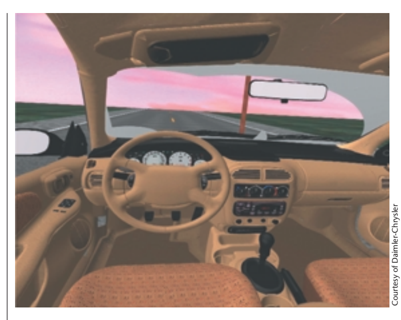
2 View of virtual windshield wiper visibility at Daimler-Chrysler's Technology Center.

approximate either the brightness or the dynamic range of a sunlight-illuminated scene.