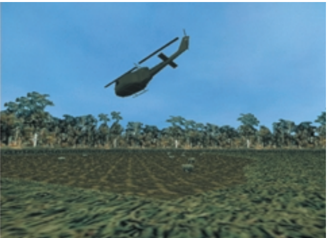
4 Vietnam war simulation at the Atlanta Veterans Administration Hospital (a) in use. (b) Imagery seen by the user.

and the alternatives to VR technology are few and poor. Of course, much training can use vehicle mockups. Weightless experience can be gained in swimming pools and 30-second-long weightless arcs in airplanes. Nonetheless, extra-vehicular activity is very difficult to simulate.