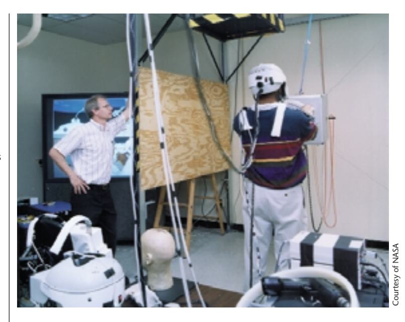
3 NASA-Houston's "Charlotte" Virtual Weightless Mass lets astronauts practice handling weightless massy objects.

mants. Four wins to date reflect the sort of savings resulting from the nontrivial investment in VR. The first study was a styling study for a new machine, normally done with a sequence of fiberboard mockups. The VR model displaced two-thirds, but not all, of the usual mockups and saved $80K in mockup cost—real savings only if you already have a CAD model of the prototyped object.