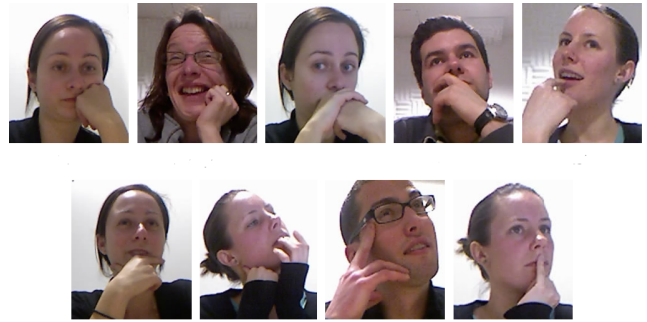
Figure 2: Sample frames from videos in the dataset Cam3D showing examples of face touches present in the dataset [20]. Note the challenging - close to natural - recording settings like inconsistent lighting conditions and strong head rotations.

To assess the coding schema and gain confidence in the labels obtained, we calculated inter-rater agreement between the two expert annotators using time-slice Krippendorff’s alpha [16], which is widely used for this type of coding assessment because of its independence of the number of assessors and its robustness against imperfect data [14]. We got a Krippendorff’s alpha coefficient of 0.92 for hand action , 0.67 for hand shape and an average alpha coefficient of 0.56 for facial region occluded (forehead 0.69, eye(s) 0.27, Nose 0.45, cheeks 0.65, lips 0.73, chin 0.83, hair/ear 0.25). All the classes had moderate agreement or above except for the facial regions: eyes, nose and hair/ear. When we explored the reason of the disagreement in these categories, this was mostly because of the very few samples available of these categories in the dataset, for example: eyes, forehead and hair/ear regions had only 25, 100 and 10 frame samples respectively, i.e. less than 0.2% of the total number of frames in total. We decided to exclude these categories (mostly upper face area) in the machine learning step, as it was unfair