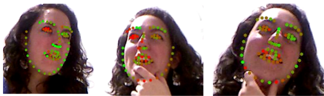
Figure 3: An example of patch expert responses in presence of occlusion. Green shows high likelihood values, while red means low likelihoods.

Facial landmark detection plays a large role in face analysis systems. In our case it is important to know where the face is in order to compute HOG appearance features around the facial region and to remove irrelevant STIP features.