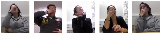
Figure 4: Sample frames from videos that were badly tracked. Note the extreme occlusion and/or head rotations.

Space time features were extracted at the original video frame rate (30 frames per second) using the implementation provided by Laptev et al. [18]. We removed the features not in the facial region by using the results from the landmark detector. For sparse coding, we used the implementation provided by Mairal et al. [23] to learn a codebook