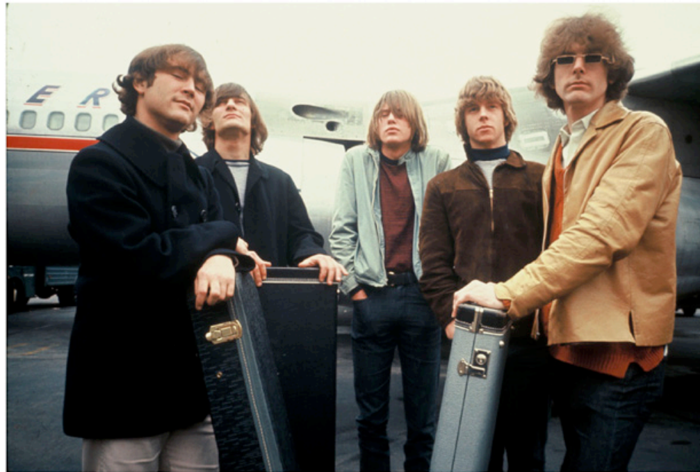
Permission to reproduce this photography is limited to editorial uses in newspapers and other regularly published periodicals, internet review outlets, and tv news programming related to SONY BMG Music Entertainment releases by THE BYRDS.