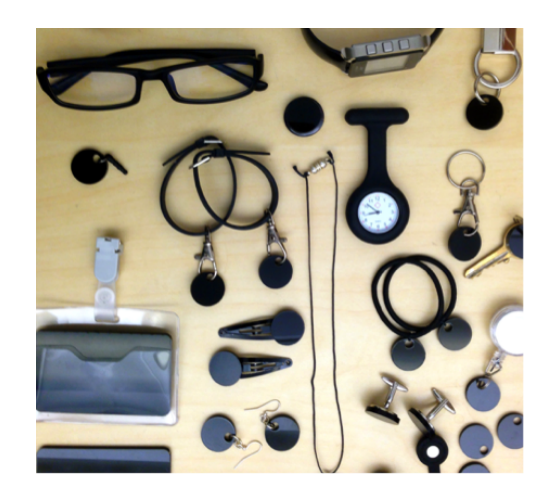
Fig. 2. Picosiblings used in interviews.