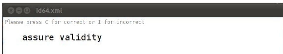
Figure 3.1: The out-of-context annotation box.

We designed the annotation scheme to allow for both OOC and IC annotation. Thus, we created a two-level annotation scheme, and the annotators are first presented with a word combination and asked to tag it as correct or incorrect depending on whether they can think of some appropriate contexts of use for it. Figure 3.1 shows the annotation tool screen presented to the annotators at this stage.