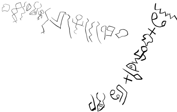
Fig. 1: Wadi el-Hol Inscriptions 1 (left) and 2 (right)