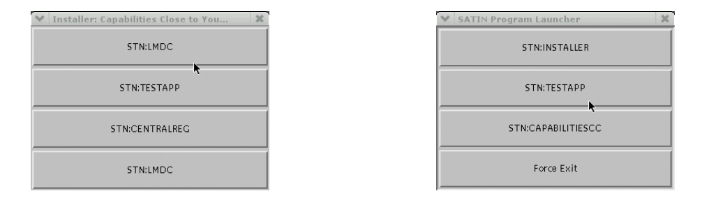
Fig. 3. (a) Showing what components are advertised on all networks, including those of the local host. (b) Component "STN:TESTAPP" was installed from a remote host and is displayed by the Launcher.

over, using the same mechanism, it can update the components installed in the system, either transparently or as a result of a user command. We deployed an implementation of the container, that monitors the usage of the components installed: If the device running the Launcher runs out of resources, it can delete unused components based on their frequency of use. The SATIN Launcher is implemented as a collection of interdependent components.