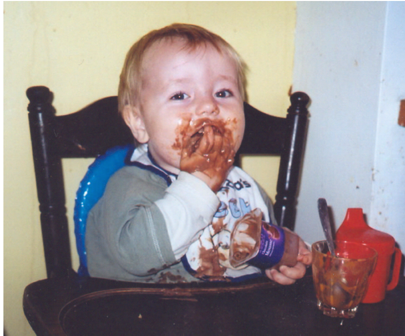
Figure 10: Self-service: September

up. At Boulter's Lock I watched some big boys playing football, and paddling in the water to get their ball out.