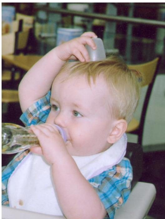
Figure 9: Communing with the Oracle: August