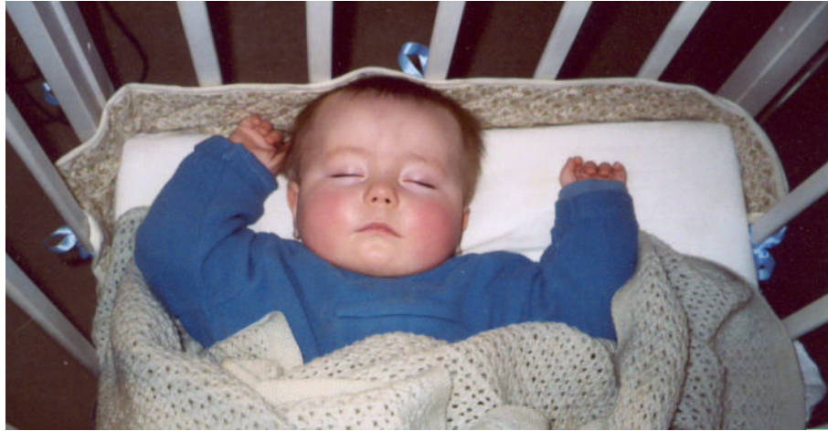
Figure 2: Resting after effort: January

because of my cold. You wouldn't believe how some of the other children crawled on the floor there. I thought they were much too young for that. Most of all I like playing on my Grandpa's piano. I use all my fingers. That's what you're supposed to do.