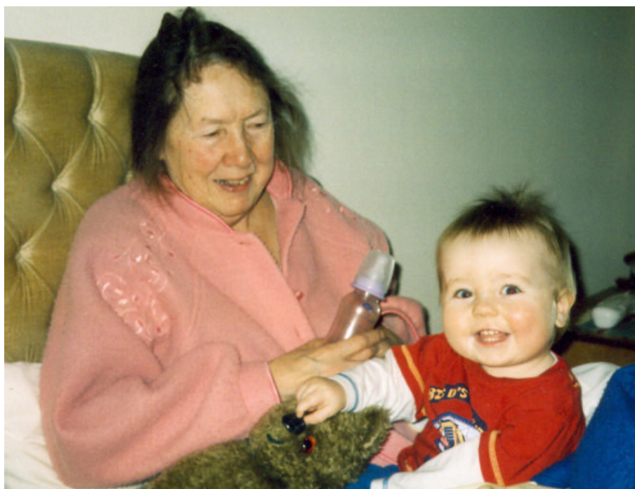
Figure 3: Monday morning early: March

a circle with his pen, and put numbers 1 to 12 round it. I pretty soon told him it was a “cluck”, after thinking about it.