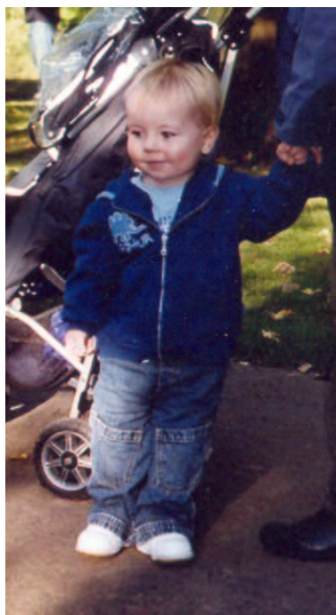
Figure 11: Squirrelling: October

Granny came to my house for her birthday tea, and it was great fun with everybody there. I was very cheerful, and played at hats with paper. At bedtime I went outside first, to look at the stars and the Moon, which is what I usually do these days.