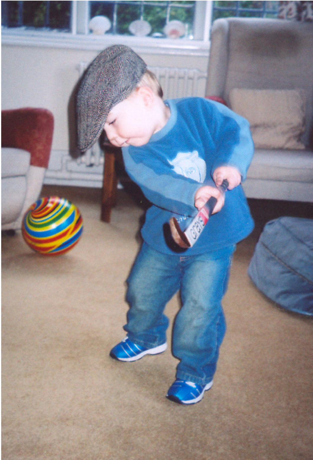
Figure 12: Getting into the swing, feet and head still: December