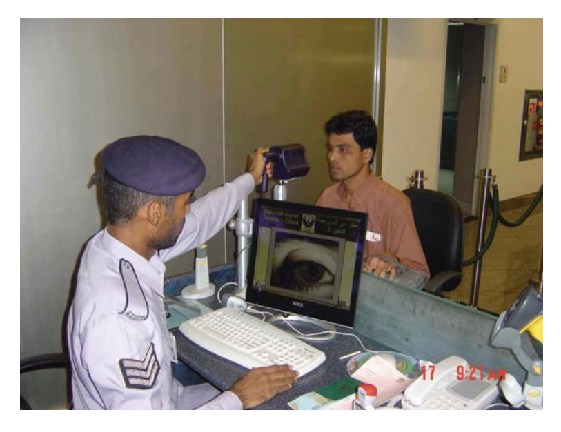
Iris Recognition at Airports and Border-Crossings. Figure 4 In the United Arab Emirates deployment of iris recognition at all the 32 air, land, and sea ports, travelers are screened against a watch-list of expellees, or persons deemed to be a security risk, before being allowed to enter the Emirates.

their work permits or committed other visa violations, but a condition of the amnesty waiver of penalties was that such persons were expelled from the Emirates for some period of time, and their iris patterns were registered in a database. This action enabled enforcement of the ban on re-entry and defeated thousands of attempts to return under false identities and with fake travel documents. Over the period 2001–2007 the database of expellees' IrisCodes was enlarged with Iris-Code databases of foreign nationals who had been imprisoned for crimes such as prostitution or drugs trafficking, and of persons deemed to be security risks or unwelcome for other reasons.