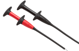
Zero when disabled