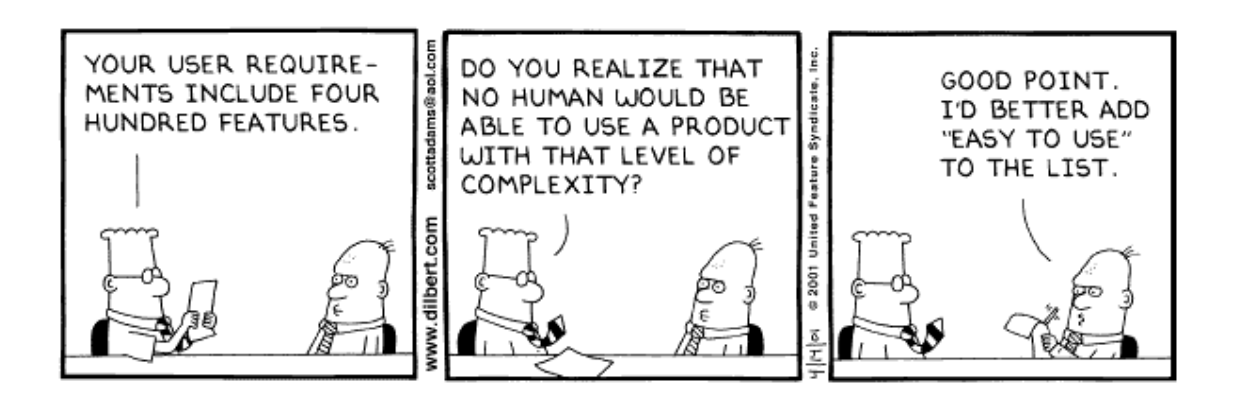
Alan Blackwell, 2007–2008

http://www.cl.cam. ac.uk/teaching/0708/HCI/