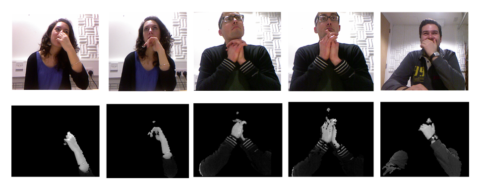
Fig. 5: Simple background subtraction based on depth threshold shows that depth images provide details of hand shape that can be utilised in automatic recognition defining different hand cues.

information can be used to improve the results of expression and gesture tracking and analysis. Cam3D provides a depth image for each frame in the labelled video segments, which enabled us to investigate the potential use of depth information in automatic detection of hand over face.