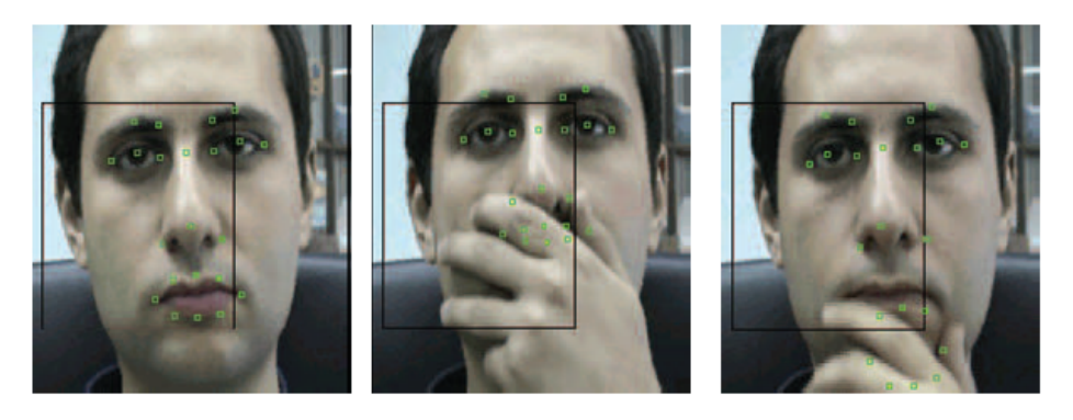
Fig. 1: In existing facial expression recognition systems hand-over-face occlusions are treated as noise.