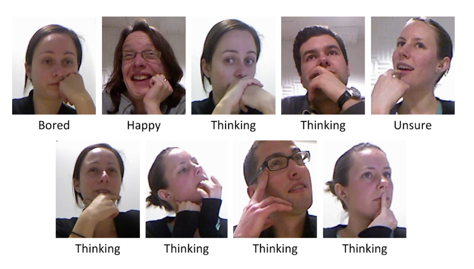
Fig. 3: Different hand shape, action and face region occluded are affective cues in interpreting different mental states.

fields of work and study. For more details on Cam3D, refer to Mahmoud et al. [13].