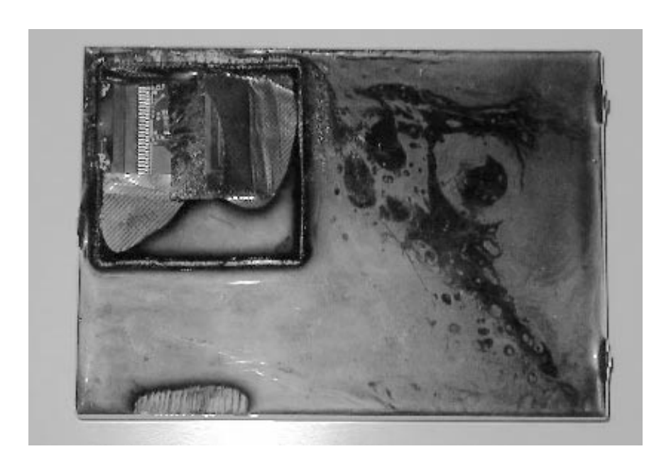
Fig. 2. – the 4758 partially opened – showing (from top left downwards) the circuitry, aluminium electromagnetic shielding, tamper sensing mesh and potting material

there is a data key; there's a data translation key; there's a MAC key; there's a PIN generation key; there's an incoming PIN encryption key; and so on. There are somewhat over 100 different transactions supplied with CCA that operate using these key types. In addition, you can define your own key types and roll your own transactions. You can download the details from the Web, all 400 and whatever pages of it [7], so the target is public domain.