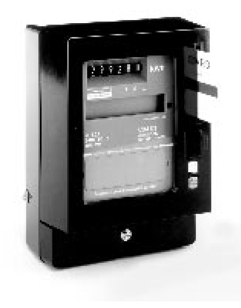
Figure 10.2: – a prepayment electricity meter