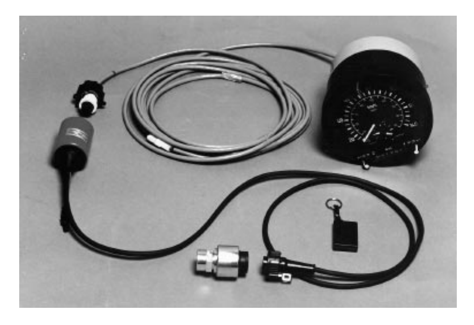
Figure 10.4: – a tachograph with an interruptor controlled by the driver using a radio key fob.

This kind of device amounts for under 1% of convictions but its use is believed to be much more widespread. It's extremely hard to find as it can be hidden at many different places in the truck's cable harness. Police officers who stop a speeding truck equipped with such a device and can't find it, have difficulty getting a conviction: the sealed and apparently correctly calibrated tachograph contradicts the evidence from their radar or camera. The next step in the arms race is the use by the police of electronic warfare techniques to detect and neutralize these 'interruptors' – and after that, no doubt the bad guys will start using cryptography to secure the communications from the key fob.