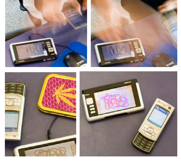
Figure 3 - a) Selecting a colour (from blue mat) by "scrubbing" gesture; b) varying brush width during bimanual interaction by "tilt" gesture; c) selection of alternative colour; d) painted result.

In this experiment, we explored bimanual interaction in which, once again, the whole device can be held in the hand as a tangible manipulation device. We imagined a user sitting "painting" with their mobile devices, working with available colours from the objects and scenery around them, (perhaps to supplement or alter a photograph of that scene).