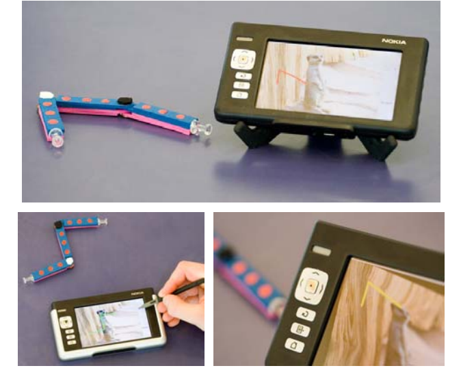
Figure 4 - a) articulated tangible device; b) selection of image warp mode; c) warped image

In this final experiment, we imagined that users might make use of other objects in their mobile computing environment as tangible interaction aids. It was clear from our first experiments that camera interaction allows the use of tangible objects that have no electronic augmentation, but are simply identified and tracked from visual input. As we had previously explored the potential of generic solid object tokens and bimanual interaction under visual tracking [4], we were interested in objects that might be articulated (i.e. having internal joints), in addition to having position and orientation control. Figure 4 shows an application in which a simple articulated object is recognised by a camera, and mapped into the plane of an image that is being edited. This might, for example, be an image that has just been captured using a camera phone, but which the user wishes to crop, annotate or enhance before sending it by MMS.