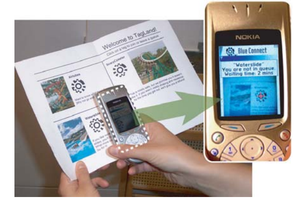
Figure 2 – Bimanual interaction between camera-phone and visual tags on printed leaflet (result of previous project with Intel Research)

Handheld devices this small can be considered as tangible interaction elements in themselves, as if a whole computer had been embedded inside a mouse. The size, form and controls on the case afford certain kinds of interaction in themselves. We were particularly taken with the fact that the N80 phone, if turned on its side, appears much like a digital camera, having a shutter button on the top, a viewfinder, and a preview screen. In earlier research [6], we had used cameraphones as interaction devices, connected by Bluetooth to a network application, which were used to recognise and link from visual tags (a kind of circular barcode suitable for low-resolution) on a printed brochure.