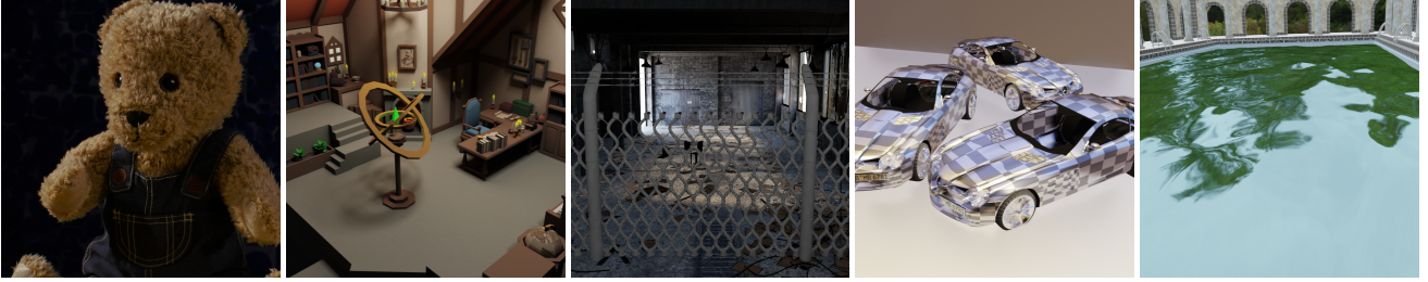
Fig. 1. A subset of scenes used for benchmarking (left to right): Large disparity : bear, sorcerers’ room, Disparity : abandoned house, Non-Lambertian materials : cars, pool. The complete dataset consists of 11 synthetic and 4 camera-captured scenes.