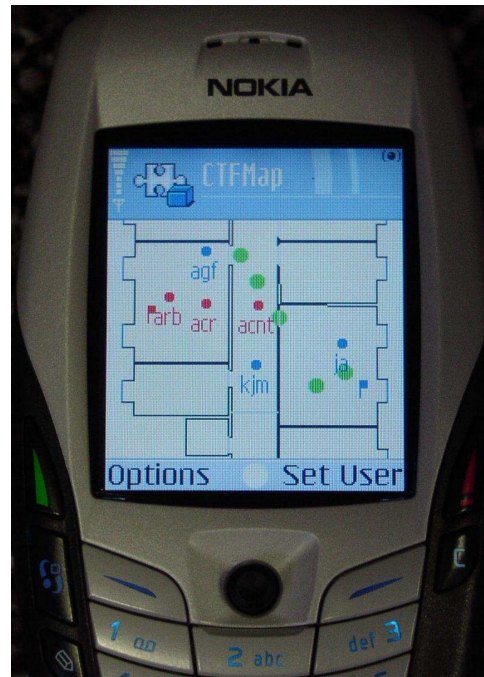
Figure 2: The game map displayed on a mobile device

An ambient display was placed near each team’s base displaying a continuously updated map of the virtual world. Due to the in-