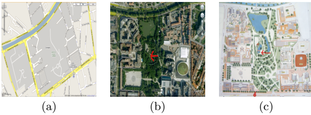
Figure 1: Difference between 2D map(a), aerial photo(b) and artistic view(c) of Compans, Toulouse

pixels coordinates in order to accurately show the current user position in the image. In the rest of the document we'll consider that GPS coordinates are expressed in latitude( \varphi ), longitude( \lambda ) and altitude( h ) using the WGS84 datum.