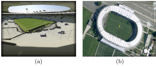
Figure 3: Perspective image(a) and aerial photo(b) of TFC stadium, Toulouse

a simple image instead of a complex 3D model. The immersion of the user into the venue (the stadium in our case) is possible via zoom in/out and scroll left/right and top/down. We don't focus on the positioning accuracy since we consider this to be a separate problem. For our experiments GPS positioning has been enough, but if higher accuracy is needed, WLAN or other type of positioning can also be used [8].