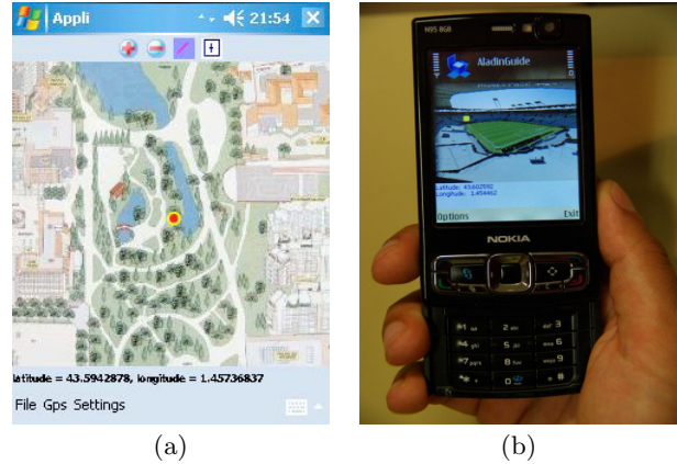
Figure 4: User Interface of implementations, artistic (a) and perspective views(b)

set of correspondences between GPS and pixel coordinates. Depending on the number of correspondences used the accuracy of results may be different. We strongly encourage the use of the first method if the 3D model is known.