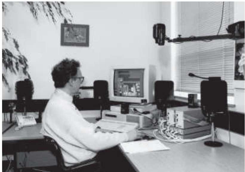
A Medusa workstation equipped with multiple cameras, speakers and microphones. Note the ATM network switches in the lower right, just under the video bricks.

looking through a remote camera does not have any extra performance cost with respect to looking through a local camera.