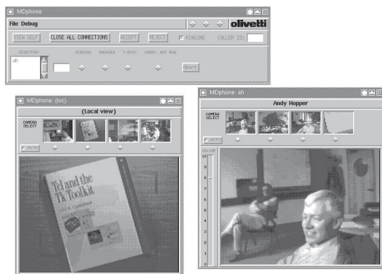
A two-way multistream conversation using MDphone

The user interface tries to present all those streams in an organic and meaningful arrangement, avoiding an excessive proliferation of controls. In view of the extension to a multi-way conference system, all the views from the same user have been grouped in a single toplevel window with many subframes. All the views are shown in small frames and one of them — selectable by the user — is replicated in a larger frame. There are plans to make this selection automatic if desired by using an image processing module that would recognise which camera the user is facing; this is already being done for the audio, where the system dynamically switches to the microphone with the loudest signal. Moving the composite window on the desktop actually pans the sound in the quadrasonic image, so that in a multi-way conference the audio positioning of the participants is coherent with the positioning of their respective windows.